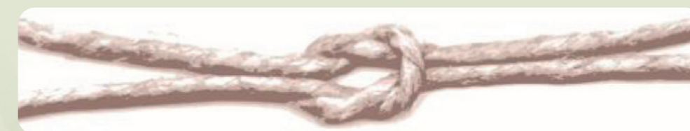
AMX: L-AMINO ACIDS: CONNECTED CHAINS