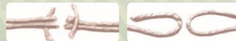
TRADITIONAL AMINO ACIDS: BROKEN CHAINS