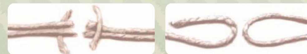
TRADITIONAL AMINO ACIDS: BROKEN CHAINS